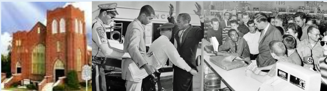
Lomax AME Zion

Featuring: Nigerian Dance (Agedege) and Drummers