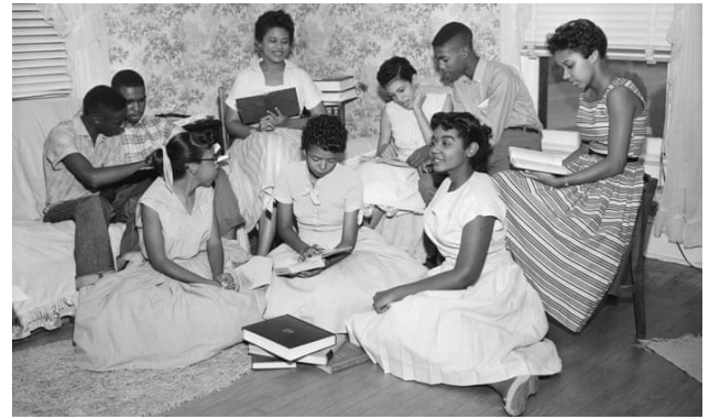
The Little Rock Nine Study Group, 1959 1/