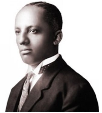
Dr. Carter G. Woodson