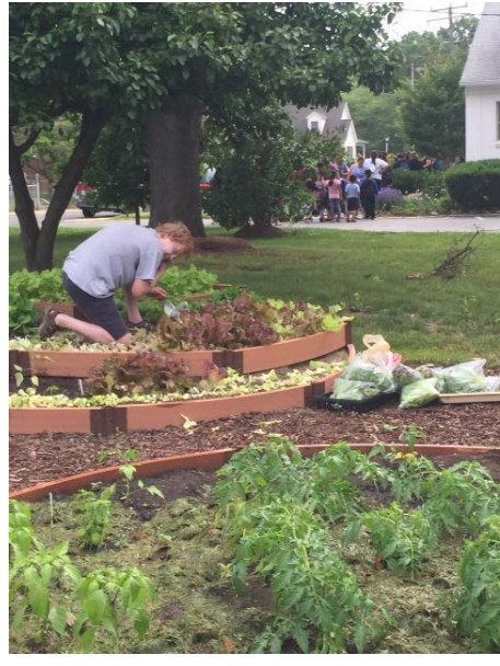
Food Pantry Garden Program

Parishioners can also find one or two areas within their daily lives to reduce their "personal carbon footprint," Kane said, like setting tangible goals for decreasing food waste or reducing vehicle emissions. "I truly feel that when we practice carefully in one area of our life, we align our other areas accordingly."